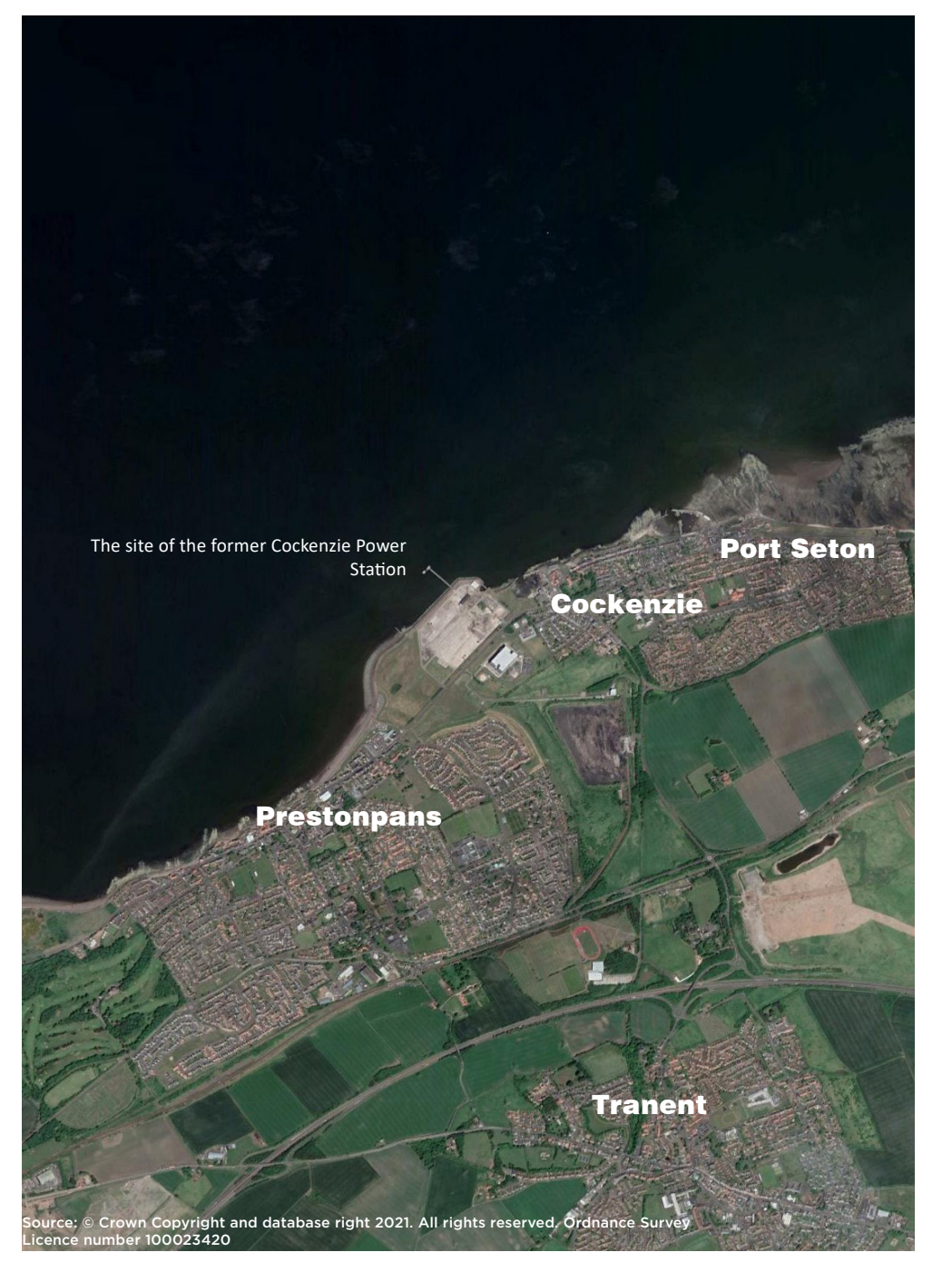
Location Aerial Map

Discussions have taken place with individuals from Scottish universities including Edinburgh Napier University and the University of the Highlands and Islands. While there are academic centres for research, and there are national and international collaborations around energy production and national marine and land parks — there is as yet no facility in existence for the general public to learn what Climate Change really means and to have the opportunity to learn about Climate Change — but to do so in a visionary, creative and educational way. This is an opportunity not just to display the implications of climate change — using both local, national and international examples — but to put forward mitigation measures which can be undertaken by individuals, communities and countries. This is the perfect site for a National Centre for Climate Change — a learning centre and study area combined, with universities able to use the space for meetings and for conferences, as well as opportunities to engage with schools — not least the local high school, Preston Lodge.