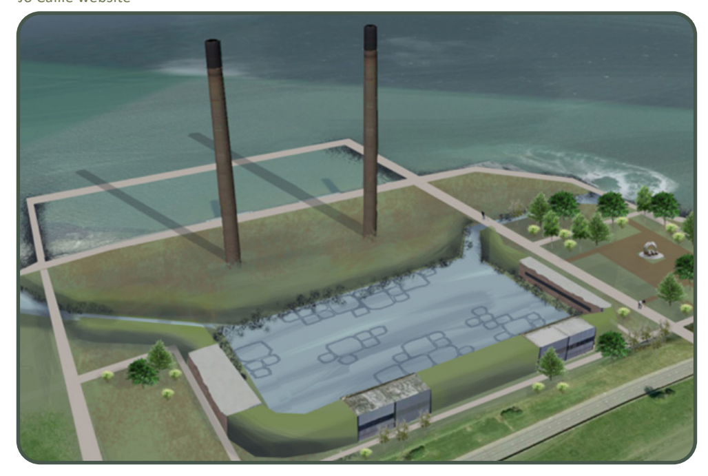
Jo Callie website

Alternatively the use of Buckminster Fuller's geodesic domes (below) – strong but lightweight – would allow a building or several buildings to be built relatively easily and cheaply on the site – in an entirely environmentally friendly way. They could be built within or on top of the site – or even within a flooded area. One idea was to have a complete globe shape – to represent the earth itself. But these are all decisions which would be made by the wider community and by the constraints of cost and implementation.